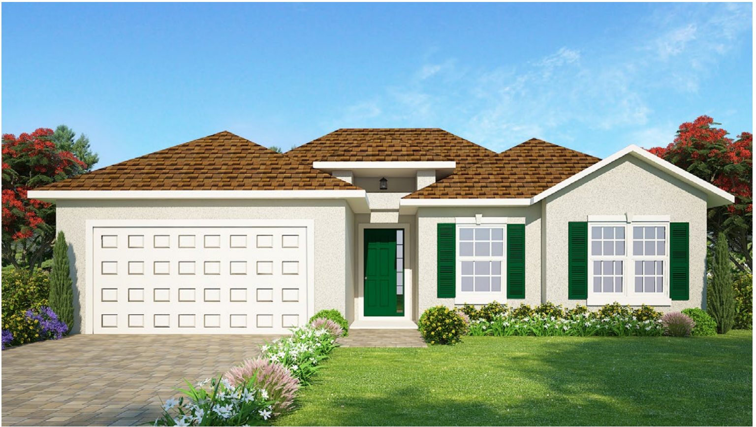
COVERED PORCH 10'-0" X 16'-0"